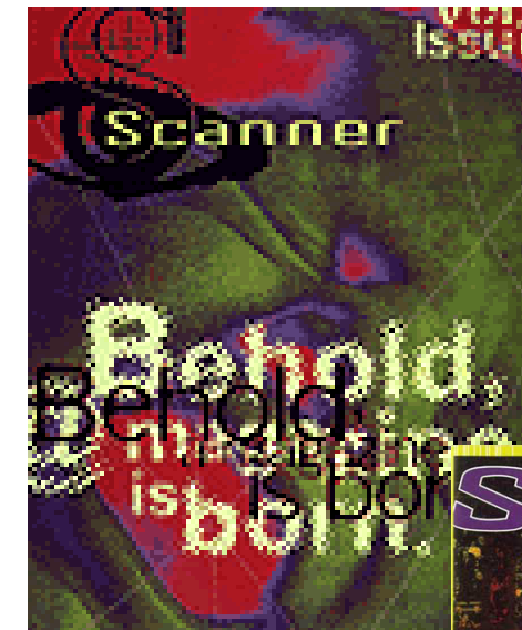
Cover to the first Scanner Magazine.